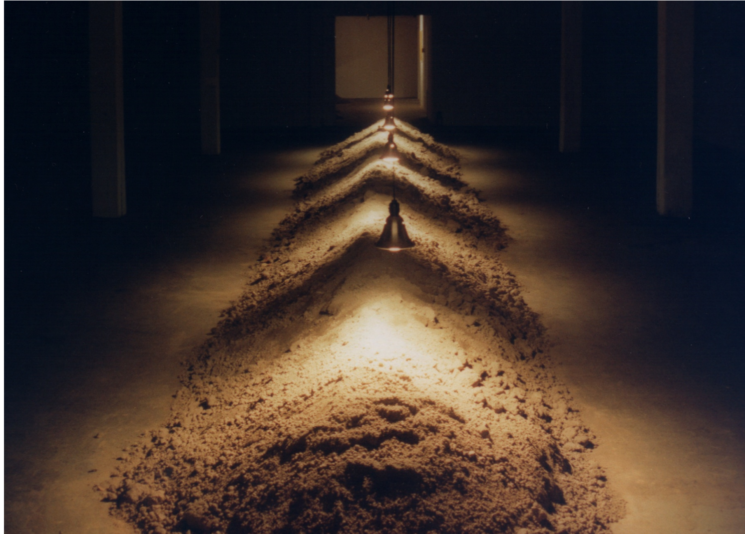
room five. (detail)